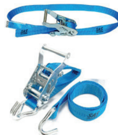
Fig. 6

Lashing straps are suitable for additional fastening. These are available in different versions and from different manufacturers.