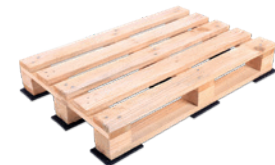
Fig. 4, Photo: www.antirutschmatte24.de Fig. 5, Photo: www.antirutschmatte24.de