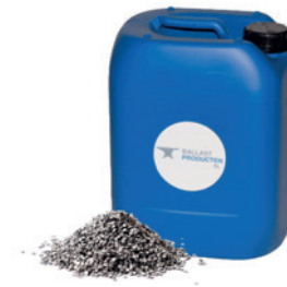
Fig. 3, Photo: www.ballast-produkte.de

Here you will find further information and ordering options for canisters.